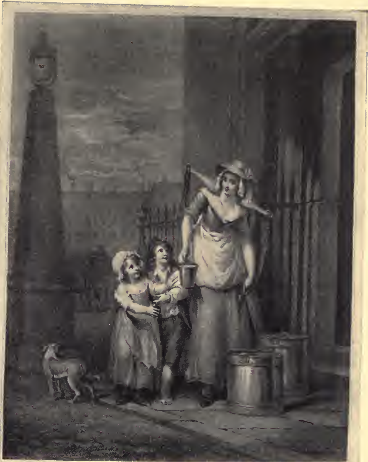
1871 The woman carrying the child on her back in the street of the city of London 1871